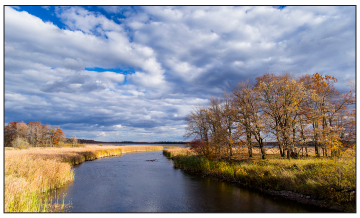
The Rum River enters Shakopee Lake near Onamia in Mille Lacs County.